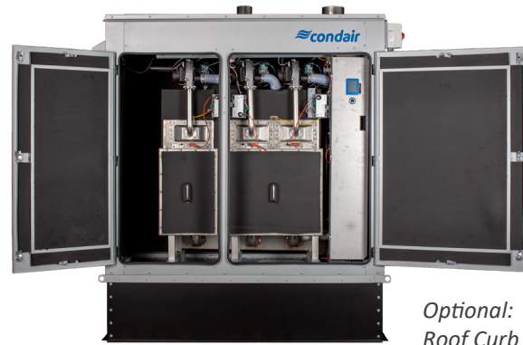
Optional: Roof Curb

The GS OC is designed to cold start at -40°C (-40°F) and survive ice, wind, and snow events. The unit also features extensive IP testing and has a rating of IP 55 for dust and water ingress protection.