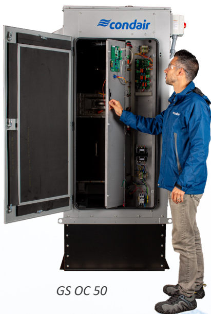
GS OC 50